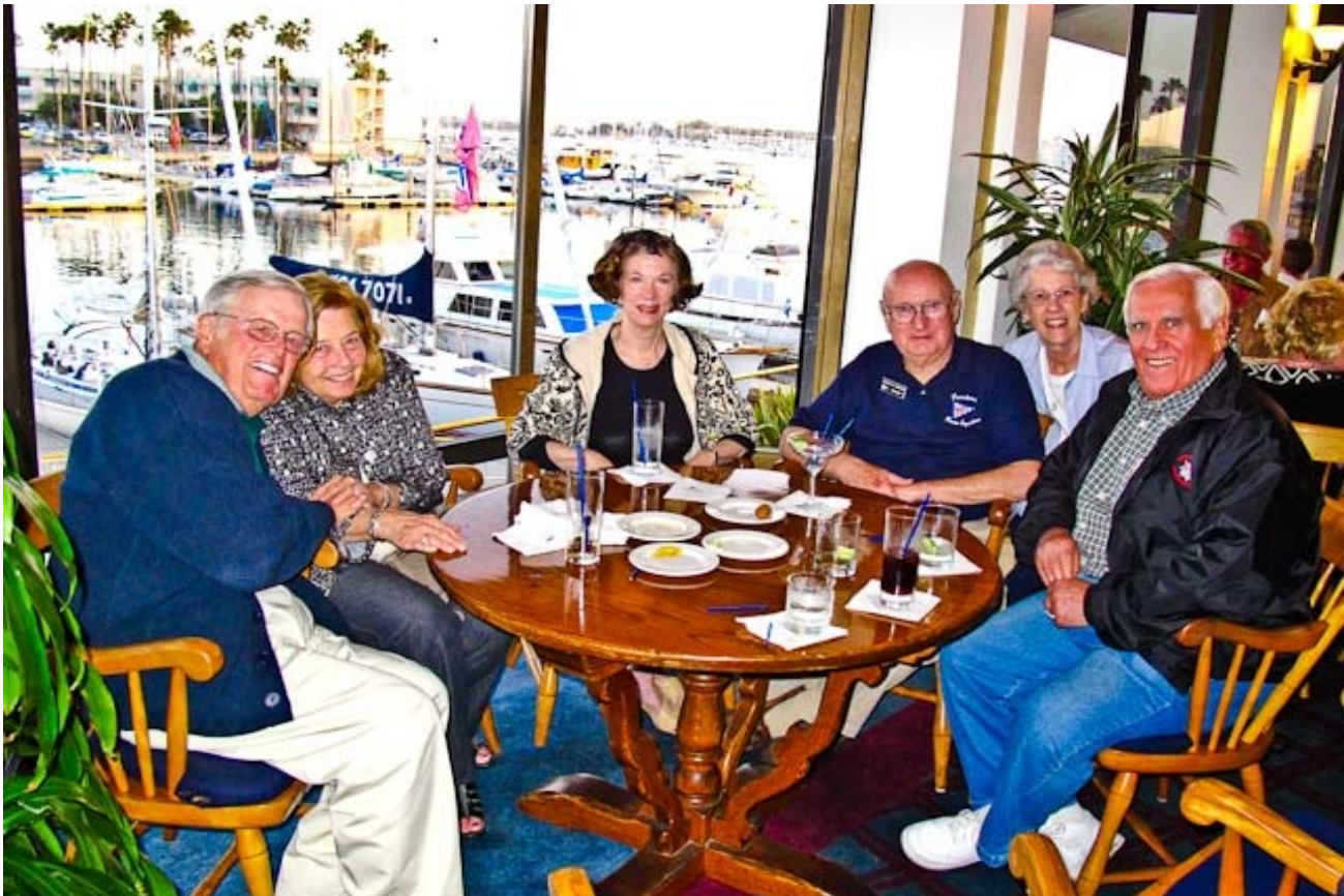
Having fun at the District13 Spring Conference