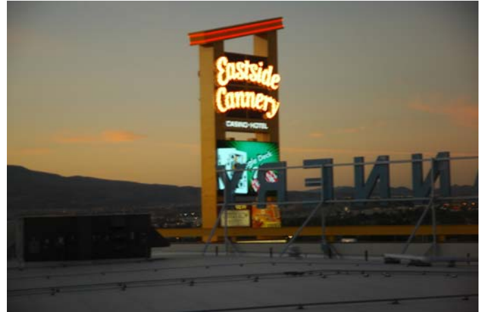
Site of District 13 Fall Conference

This left just enough time to change for the dress-casual evening activities. All attendees were invited to the District Commander's reception that preceded dinner. The dinner-dance entrees were generous portions of salmon and steak. Entertainment was provided by the local high school Marine Corp Junior ROTC unit which gave an excellent drill team performance. After an evening of dancing and door prize distributions, another excellent conference came to an end.