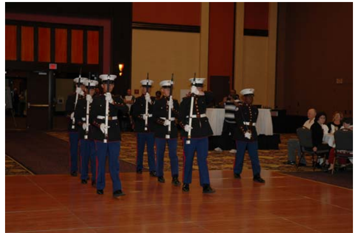
Local High School Marine Corp ROTC Unit